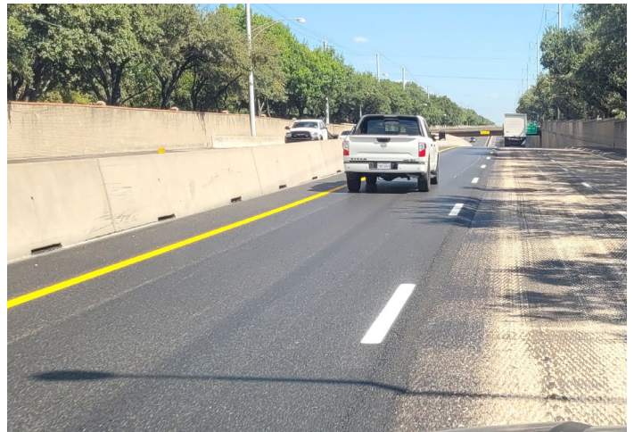
Left lane resurfaced