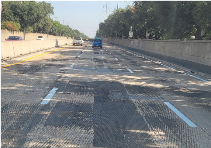
DNT ready for new driving surface