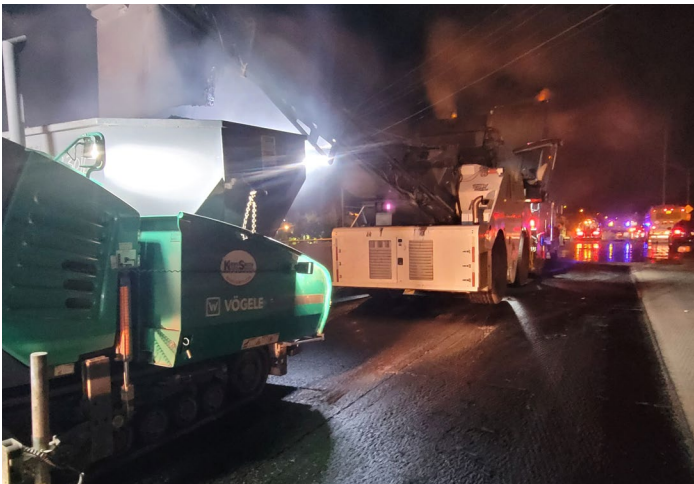
Placing new surface