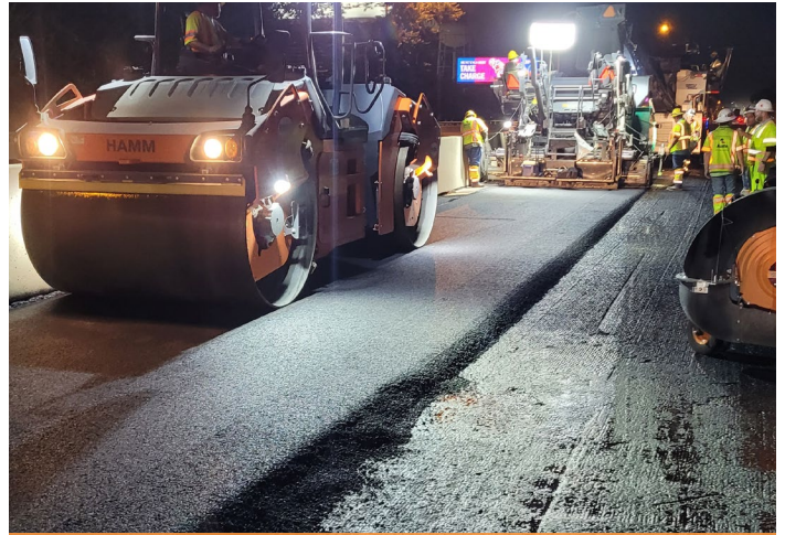
Placing new overlay on left lane