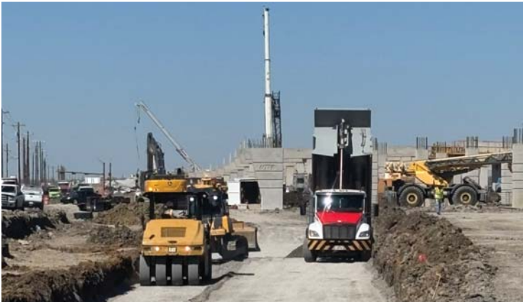
Grading work north of First St.