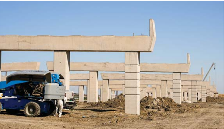
Completed columns and caps