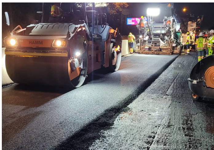
Placing new overlay on left lane