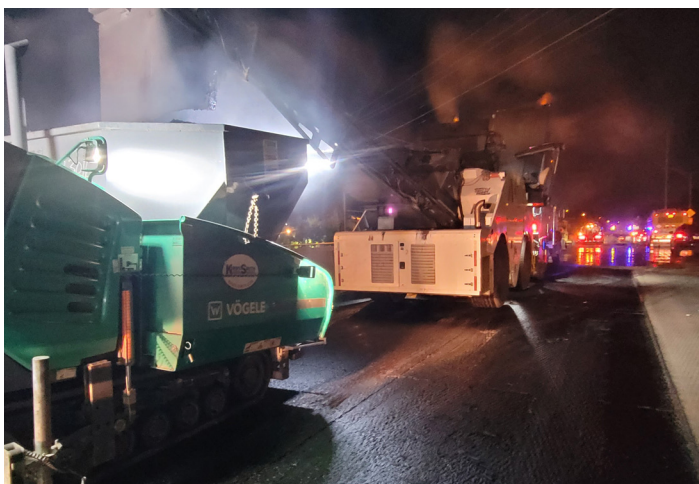
Placing new surface