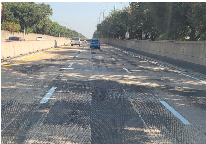
DNT ready for new driving surface