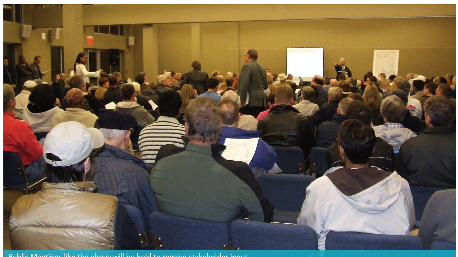
Public Meetings like the above will be held to receive stakeholder input