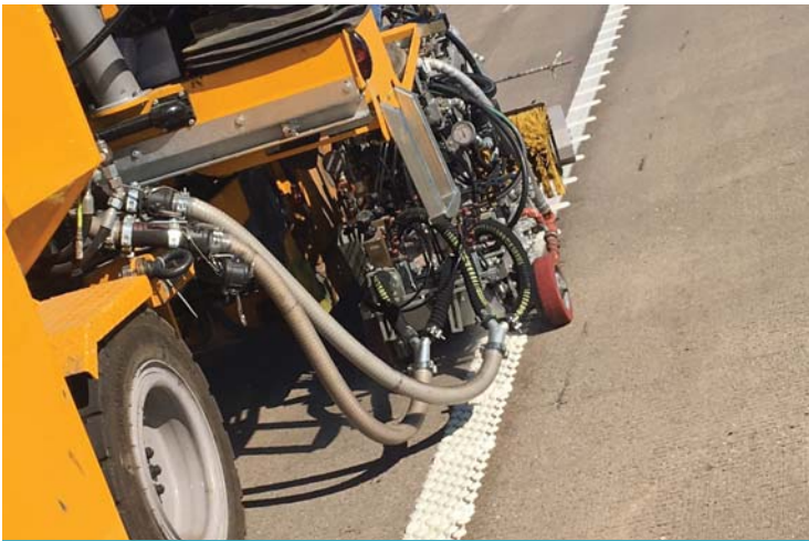
Placing pavement markings