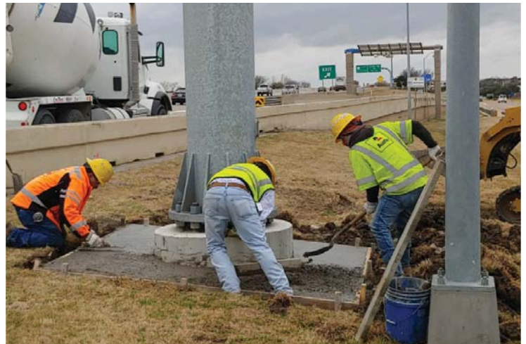
Placing concrete at column base