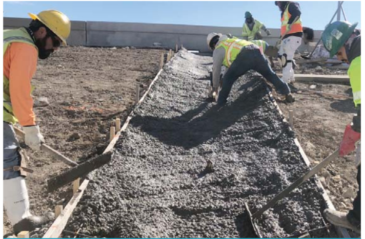
Placing concrete for drainage