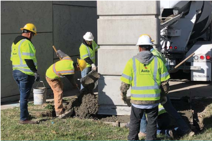
Placing concrete at column base