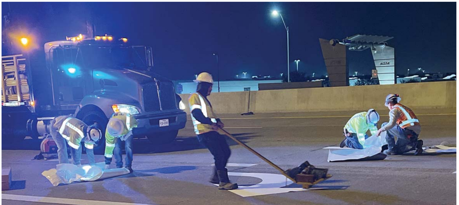
Finishing work continues along the SRT after new fourth lanes opened to traffic in Dec. 2021.