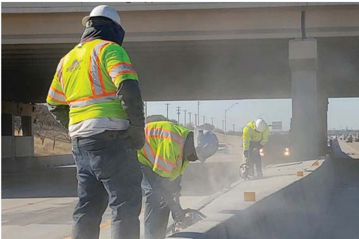
Finishing work on traffic rail