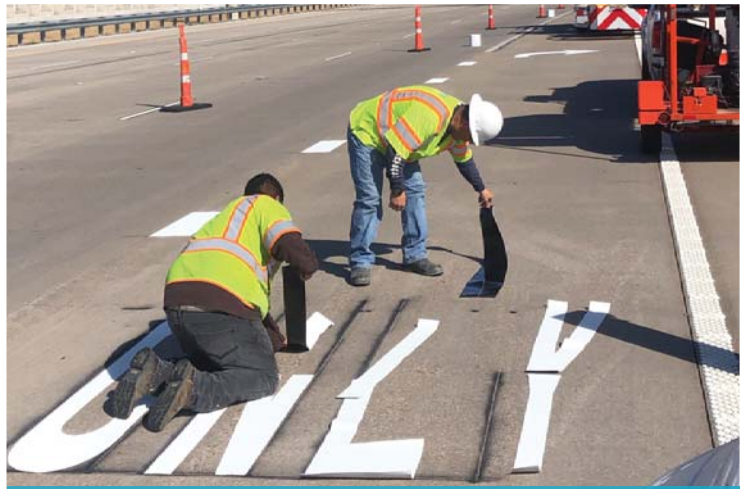
Placing pavement markings at exit ramp