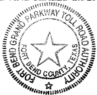
Secretary, Board of Directors

SIGNED AND SEALED the 21 st day of August, 2013.